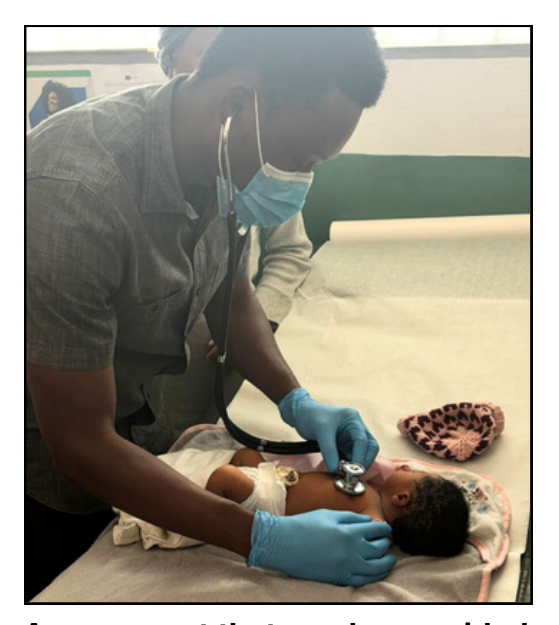
Any support that can be provided for the mother-child pair is greatly appreciated.

In November 2024, a 21-year-old woman was admitted to the Women's Civil Prison while 37 weeks pregnant. Two weeks later, she showed symptoms suggesting labor and was sent to a local hospital. After 24 hours, however, the hospital's medical team sent her back to the prison due to a lack of space.