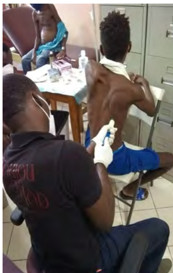
PHOTO: Removing fluid from the lungs of a patient with TB in the prison.

In spite of all of this and more, HtW staff enter the Haitian prisons daily and deliver care and treatment. Dozens of persons with tuberculosis have been newly identified and placed into treatment. Hundreds of persons receive their medication for HIV infections inside the prisons. HtW staff completed training this month to begin offering and administering COVID-19 vaccinations to all incarcerated persons in Haiti in early 2022.