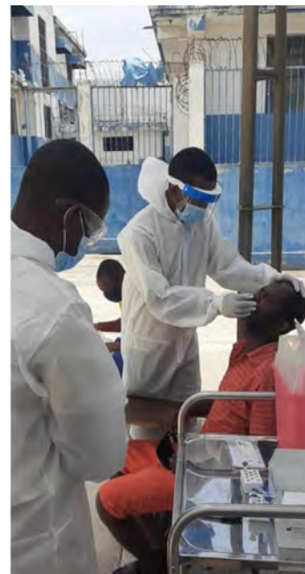
PHOTO: COVID-19 testing at Haiti's National Penitentiary.