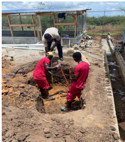
PHOTOS: Incarcerated persons (above) preparing farm land. Completed chicken coop (below) built by the team.

Haiti's political instability and street violence has created shortages of food within the prisons, resulting in severe malnutrition and exacerbating the impact of chronic and infectious disease. In early December, HtW announced a significant, short-term arrangement with World Hope International, Rise Against Hunger and AHF to deliver 12 shipping containers full of food donations from the USA that will cover food needs in the prisons for at least 3 months. Nutritional assessments are being done by the University of Florida with HtW. As a longer term solution, HtW is implementing a grant from US State Department International Narcotics and Law Enforcement to pilot food production at one of Haiti's rural prisons. Farming and planting is progressing with technical expertise from Medicine and Food for Kids. An aquaponics system has been installed and now functioning with technical expertise from Enterprise Aquatics of Louisiana who connected to HtW at an American Correctional Association conference. Additionally, a chicken coop has been constructed and layers have been delivered. These projects provide education, training and skills to incarcerated persons which they can take with them upon release, while also moving the prison system to food self-sufficiency.