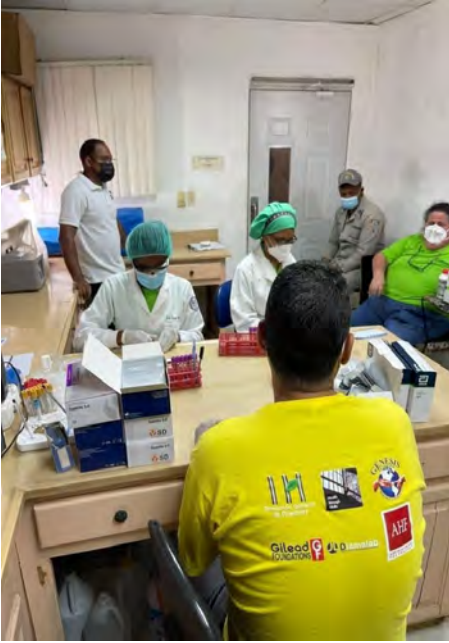
PHOTO: Laboratory located inside La Victoria Penitentiary processing thousands of hepatitis C, HIV and syphilis tests for HtW.