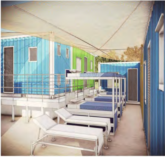
Proposed section of the emergency COVID-19 treatment prison unit designed by volunteer architects.