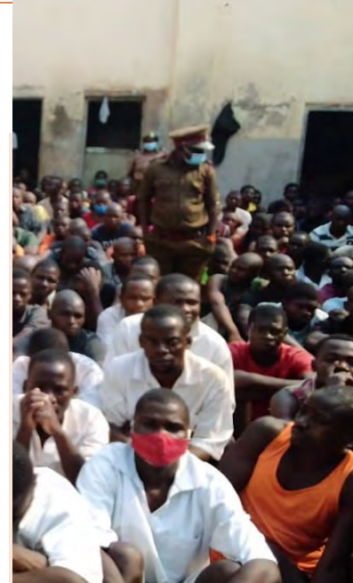
Out of cell time in crowded prison during COVID-19