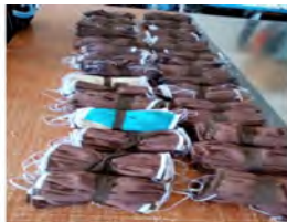
Packs of finished cloth masks.