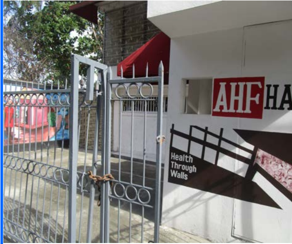
PHOTO LEFT: AHF/HtW community HIV testing campaign in Haiti, August 2017.