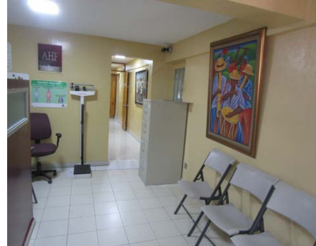
PHOTO ABOVE: The new AHF/HtW clinic for former prisoners and their families.

for the provision of more support services for the increasing number of patients. In 2018, the clinic served more than 1,500 persons. It is a place where people can receive care and treatment without stigma or shame.