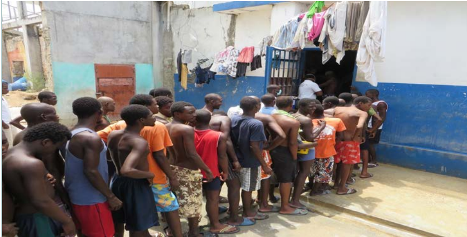
PHOTO ABOVE: Prisoners at Haiti's National Penitentiary in line to receive treatment for tuberculosis. Although the room is intended for only 30 prisoners, more than 130 persons are locked inside each daily.

As recent as 10 years ago, tuberculosis and HIV/AIDS was the leading cause of death for persons in Haitian prisons. Both disease are preventable and treatable, and should not result in death. The work of Health through Walls' (HtW) dedicated staff and volunteers in Haiti has changed the outcome of those in prison who develop tuberculosis or have HIV/AIDS despite severe overcrowding and horrid conditions. Thanks to support from partners like the USAID, Gilead Foundation, AHF and Global Fund, prisoners are screened for both diseases, identified and treated, resulting in great reductions in death and transmission to others.