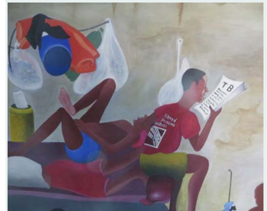
ABOVE: Art created by Prisoner Peer Educators in Haiti published in the W.H.O. document. This painting shows prisoners reading materials about tuberculosis.

In 2018, the World Health Organization (W.H.O.) published a document of good practices on tuberculosis care in prisons featuring a section on HtW's work in Haiti and digital x-ray screening.