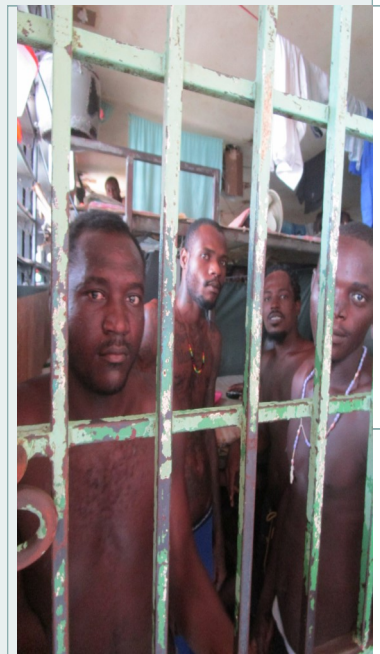
Typical overcrowded prison cell without running water.

A COMPREHENSIVE TUBERCULOSIS SCREENING AND TREATMENT PROGRAM IN HAITIAN PRISONS IS MAKING A DIFFERENCE