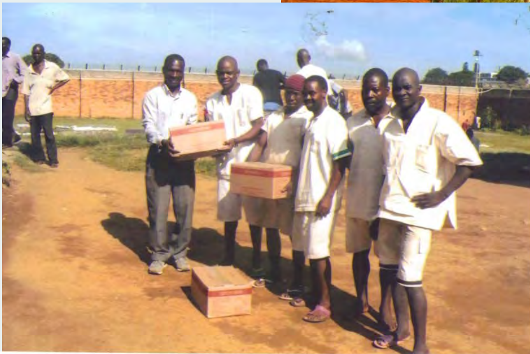
CHIKWAWA FARM PRISON NEAR THE BORDER OF MALAWI & MOZAMBIQUE