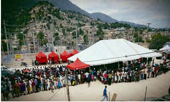
PHOTO ABOVE: AHF/HtW community HIV testing campaign in Haiti, August 2017.

HtW now works with AIDS Healthcare Foundation (AHF) in Haiti, Dominican Republic and Jamaica by staffing community health clinics for released prisoners and their contacts or families. The HtW-AHF partnership exists to reduce the barriers to HIV and TB care and treatment for former prisoners. Previously stymied by stigma, denial, shame, poverty and more, former prisoners were often lost to follow-up medical care. These community clinics, supported by AHF, are places where former prisoners and their partners can receive care free-of-charge. HtWs' prison care managers and discharge planners link prisoners to these clinics upon release. Often the same doctor who treated them in the prison and with whom they have developed trust is the same doctor in the community clinic. Furthermore, in the Dominican Republic, HtW works with Foundation Genesis and AHF to offer free HIV testing and treatment to prison visitors. As of December 2017, more than 1,000 persons are enrolled and receiving care in these community clinics.