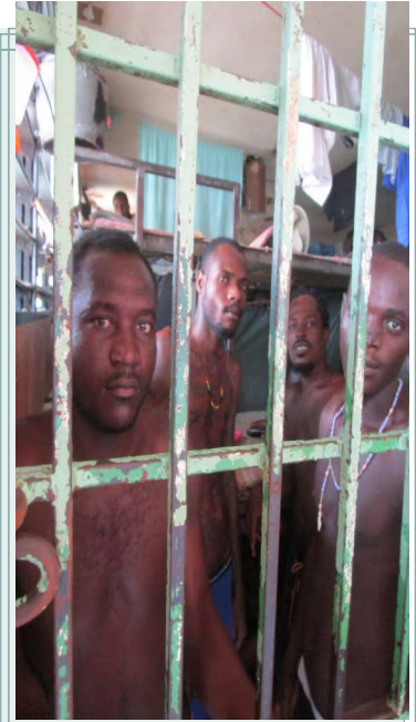
Typical overcrowded prison cell without running water .

Shocking as it was, prisoners in Haiti's National Penitentiary were dying of malnutrition in early 2017. Monies apportioned for prisoner food did not make it to the prison in the final months of an interim national government. Health through Walls (HtW) bore witness to the disaster and rallied solutions which were finally realized when the new government assumed leadership and corrected the problem. Meanwhile, HtW staff worked around-the-clock to provide support and nutrition to prisoners weakened by disease and malnutrition.