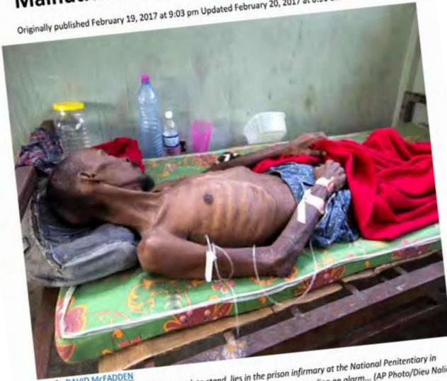
In this Feb. 13, 2017 photo, a prisoner, too weak to stand, lies in the prison infirmary at the National Penitentiary in downtown Port-au-Prince, Haiti. Haitian prosecutors and rights activists are sounding an alarm...

Originally published February 19, 2017 at 9:03 pm Updated February 20, 2017 at 8:56 am