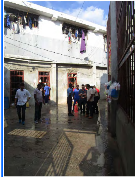
PHOTO ABOVE: AHF Board Members tour Haiti's National Penitentiary to understand the health needs of prisoners, December 2017.