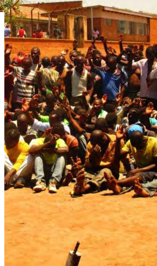
PASTOR STANDING WITH THE INMATES FROM MALAWI AND MOZAMBIQUE