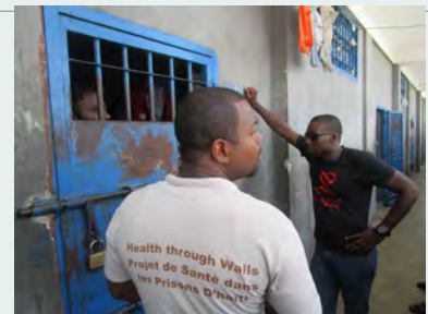
ABOVE: HtW staff conducting cell checks for malnourished prisoners.