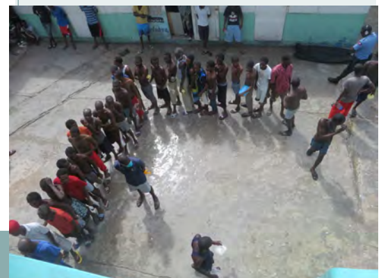
BELOW: Prisoners in line for nutritional supplements.